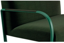
Armrests CI - only pad